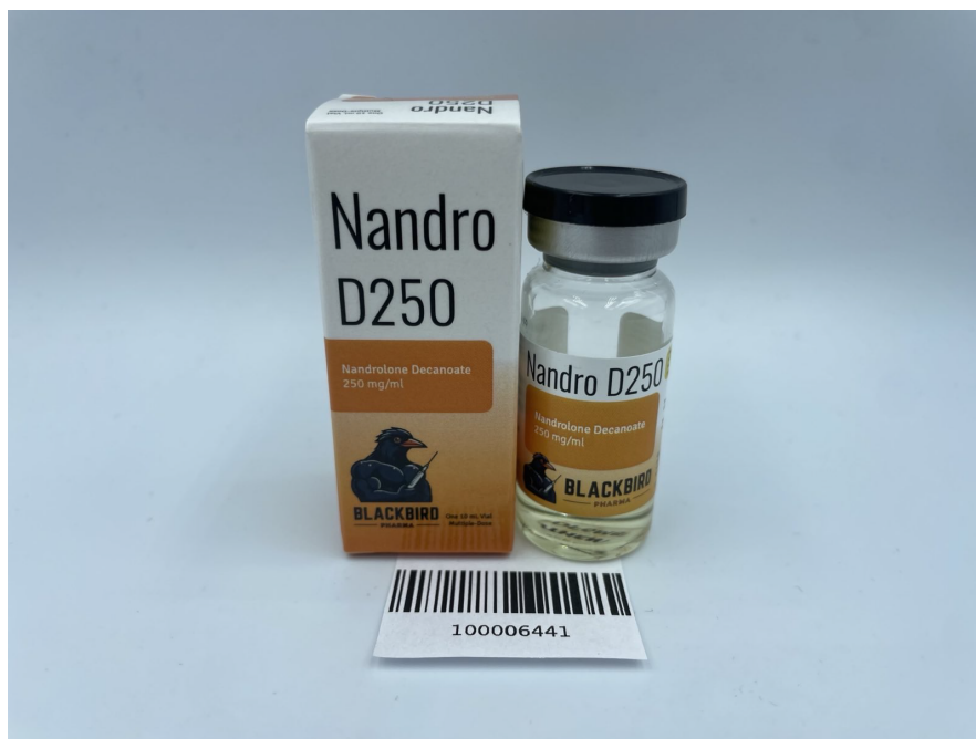
Photo of the test sample

The test sample was applied in the amount of 3 \mu l to the BioBasic 8 Thermo Scientific column. During the course of the analysis with the method a linear gradient in the solutions of H 2 O and Acetonitrile with the addition of 0.1% trifluoroacetic acid, a peak of the substance appeared. Its concentration, when compared to the reference chromatogram, is 256,54mg/ml. Height the measurement error is + - 1 mg. The actual state of the sample sent before the test is presented on the photo below