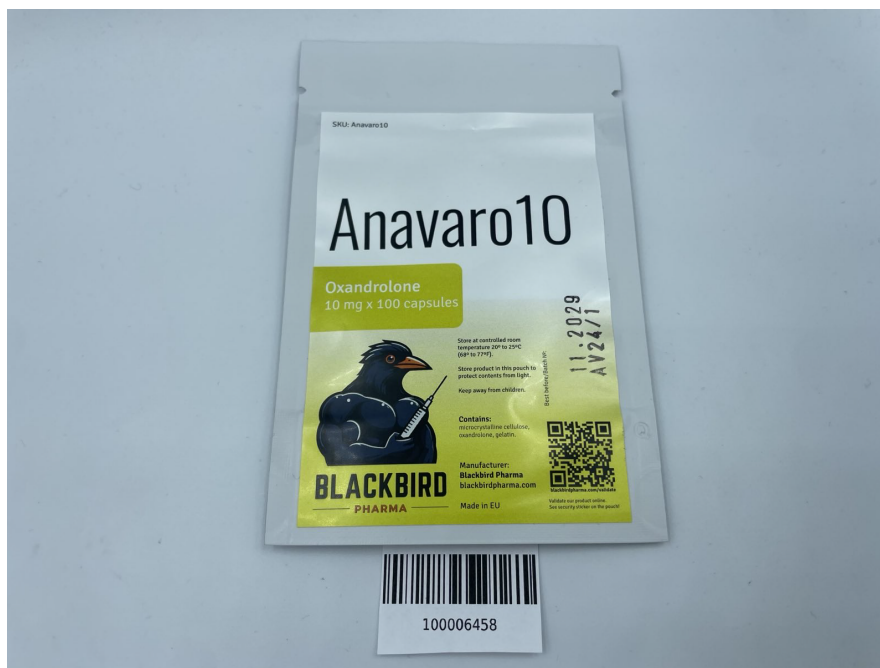
Photo of the test sample

The test sample was applied in the amount of 6µl to the BioBasic 8 Thermo Scientific column. During the course of the analysis with the method a linear gradient in the solutions of H2O and Acetonitrile with the addition of 0.1% trifluoroacetic acid, a peak of the sought substance appeared. Its concentration, when compared to the reference chromatogram, is 11,35mg/caps. Height the measurement error is + - 0,05 mg. The actual state of the sample sent before the test is presented on the photo below